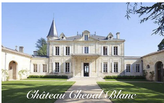
Château Cheval Blanc