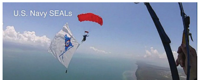
SEALS UP CLOSE AND PERSONAL AT OCEAN REEF