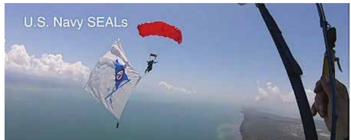
SEALS UP CLOSE AND PERSONAL AT OCEAN REEF